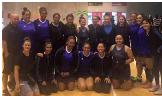
Collegiate Super 14 Winners