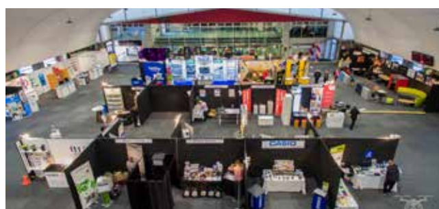
Office Products Expo