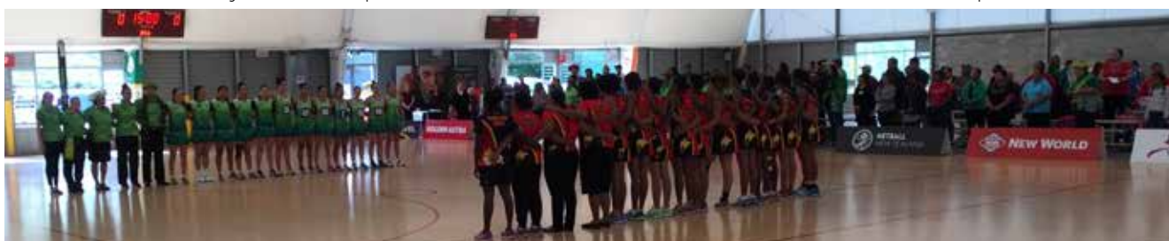
Cook Islands & Papua New Guinea U21 teams