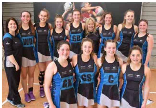
2016 College Premier Winners Long Bay College