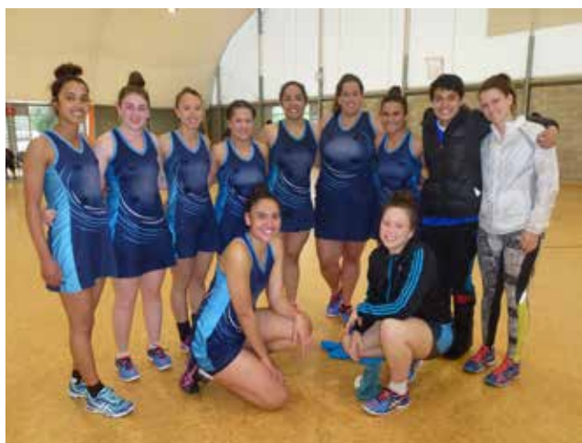
2016 Premier 1 Winners Collegiate 1