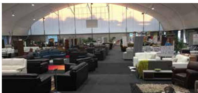
Harvey Norman Expo

Balancing the use of the facility with Netball programmes and that of community and corporate hires continues to be a challenge at times, but it is realised that without the opportunity to generate hireage outside of netball, we would not be able to maintain the facility to its current high standard.