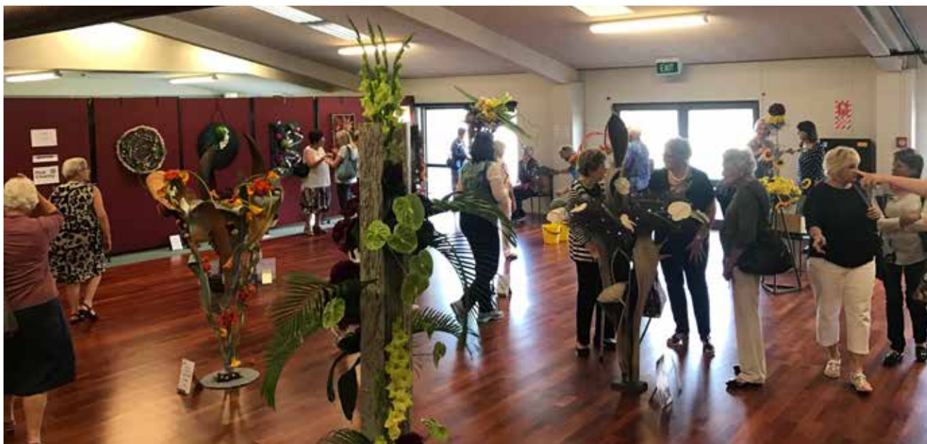
Takapuna Floral Art