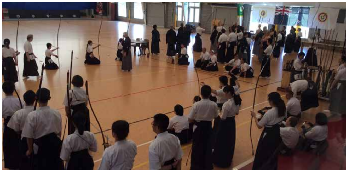
NZ Kyudo Federation Japanese Archery Grading Examination