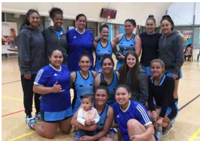
Super 14 Winners Collegiate