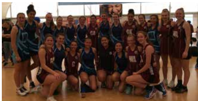
2017 College Premier Finalists Carmel 1 & Whangaparaoa 1