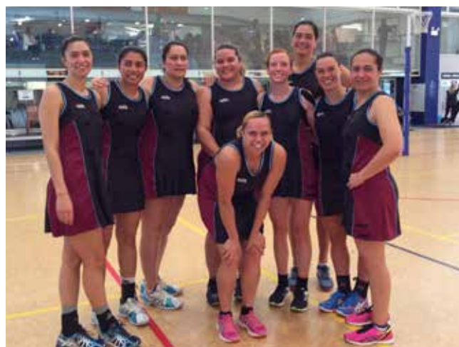
2017 Premier 1 Runners Up North Shore Old Girls