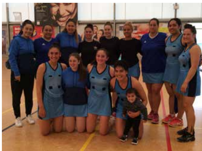
2017 Premier 1 Winners Collegiate 1